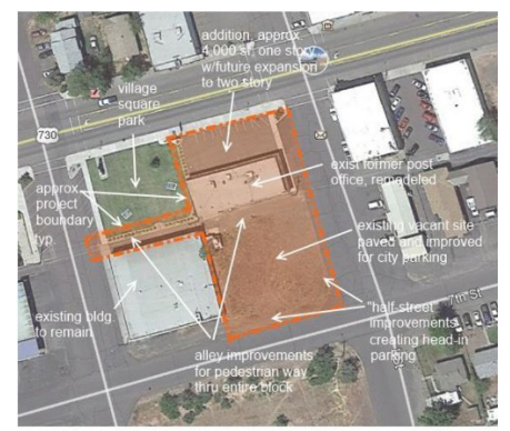
UMATILLA BUSINESS CENTER PROJECT

Planning Continues on the Old Post Office (aka Umatilla Business Center)