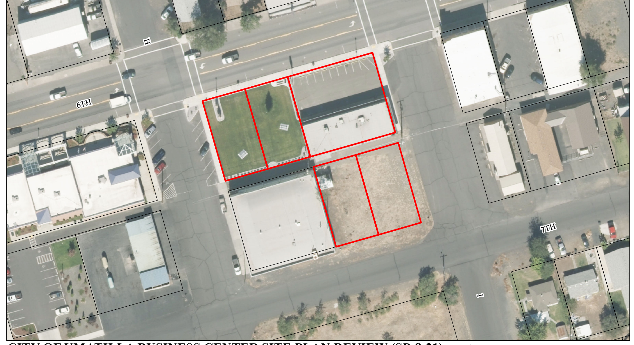
CITY OF UMATILLA BUSINESS CENTER SITE PLAN REVIEW (SP-8-21)

*Notice given to property owners within 100'