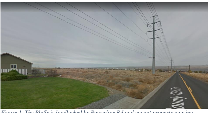
Figure 1. The Bluffs is landlocked by Powerline Rd and vacant property causing limited walkability anywhere.