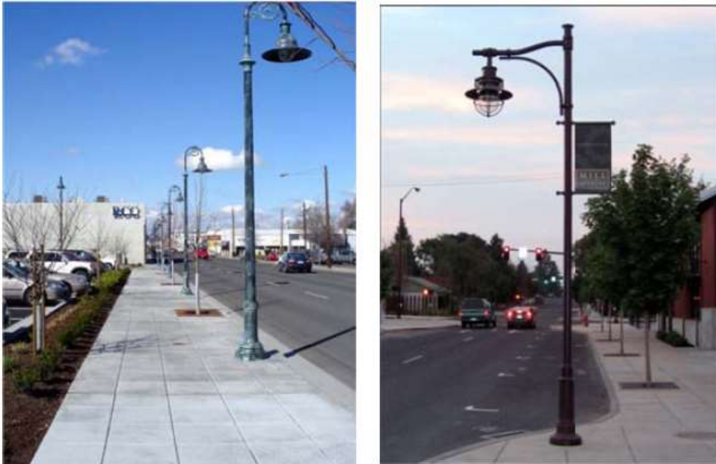
FIGURE 10-1 PEDESTRIAN ORIENTED LIGHTING EXAMPLES

(Ord. 766, 12-6-2011)